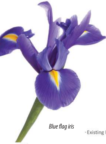
Blue flag iris

In partnership with East Stroudsburg Area School District, Brodhead Watershed Association created rain gardens to catch runoff from the school's parking lot. The soil and native plants absorb polluted water, preventing it from reaching the nearby creek and your water supply.