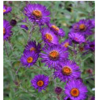
Aster New England