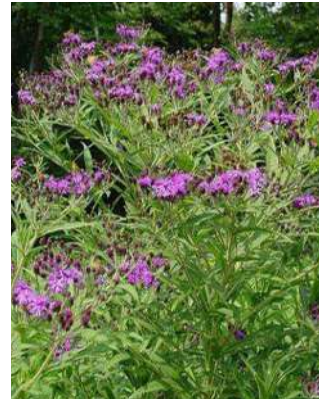
New York Ironweed