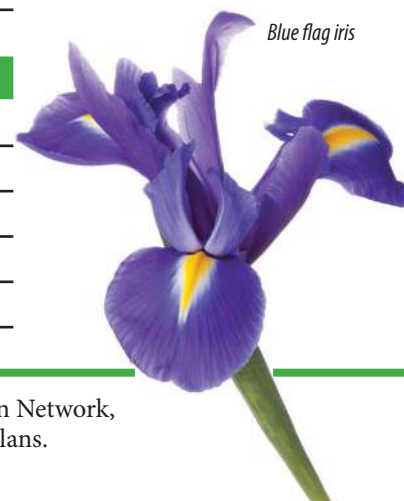
Blue flag iris

This garden and supporting green infrastructure was made possible by grants from Water Resources Education Network, the Cora Brooks Foundation and the Brodhead chapter of Trout Unlimited. Brick Linder laid out the garden plans. Wayne Ross of Ross & Ross Nursery in Cresco did the design and planting.