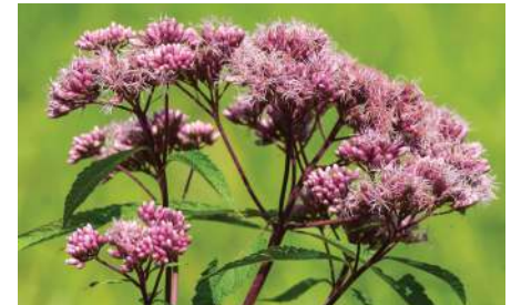
Joe Pye Weed

In partnership with Barrett Paradise Friendly Library, Brodhead Watershed Association created a garden to catch runoff from the library's roof and parking lot as well as the adjacent roadway. The soil and native plants absorb the polluted water, preventing it from reaching the nearby creek and your water supply.