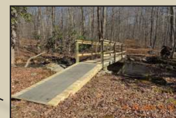
BRIDGE CROSSING GRISCOM RUN

The trails on this map are located on Buck Hill Falls Company property and are open for the private enjoyment of the residents, their guests, and for the greater community by permission from the Buck Hill Falls Company office: 570-595-7511