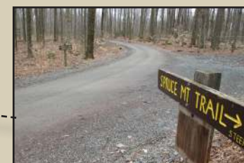
SIGNS BACK TO BHF & MAPLE SUGAR TAPS