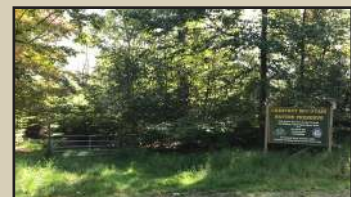
CHESTNUT MT TRAILHEAD, off Rt. 191

The Chestnut Mt. trailhead is on Rt. 191