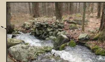
NICK SAW MILL SITE