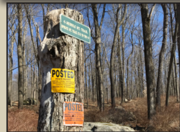
TRAIL SIGN Porcupine markings