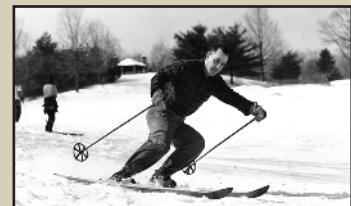
PROPOSED SKI SLOPES, early 1960s