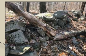
OLD TOWNSHIP RD. Stacked stones