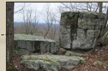
ROCK CABIN OVERLOOK