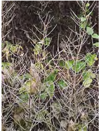
Alliaria petiolata (M. Bieb.) Cavara & Grande