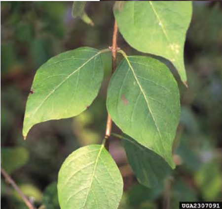
Lonicera maackii (Rupr.) Herder