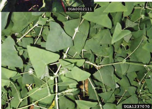
Polygonum perfoliatum L.