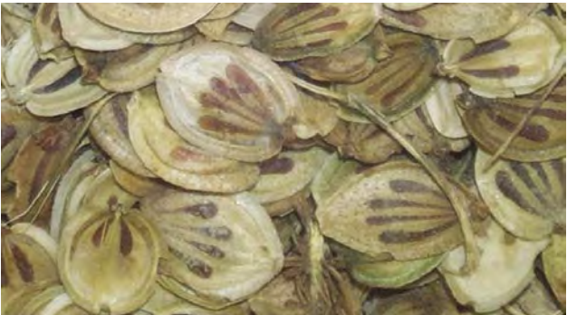
Heracleum mantegazzianum Sommier & Levier.