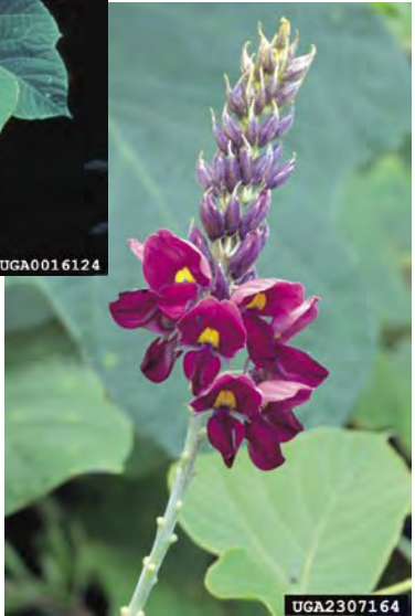
Pueraria montana (Lour.) Merr. var. lobata (Willd.) Maesen & Almeida