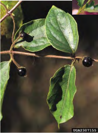
Lonicera japonica Thunb.