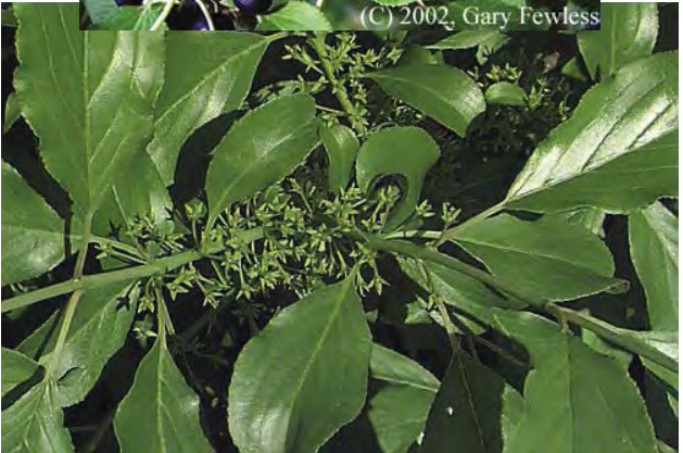
Rhamnus cathartica L.