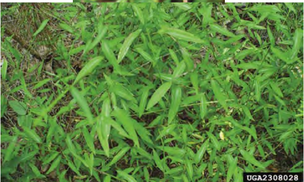
Microstegium vimineum (Trin.) A. Camus