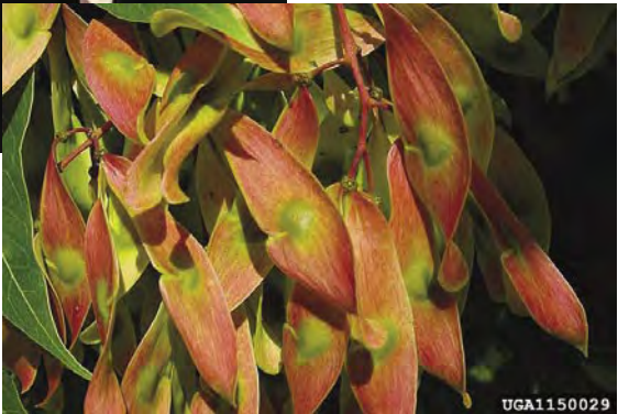
Ailanthus altissima (Mill.) Swingle