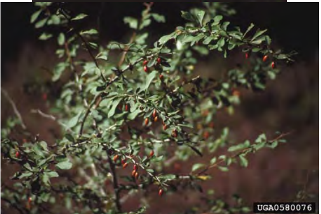
Berberis thunbergii DC.