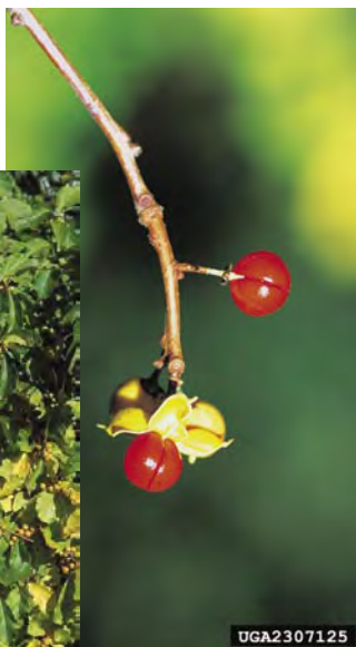
Celastrus orbiculatus Thunb.