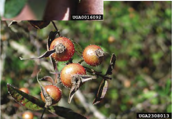
Rosa multiflora Thunb.