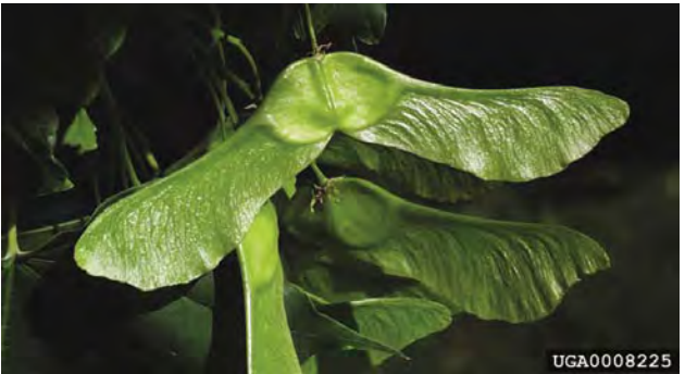
Acer platanoides L.