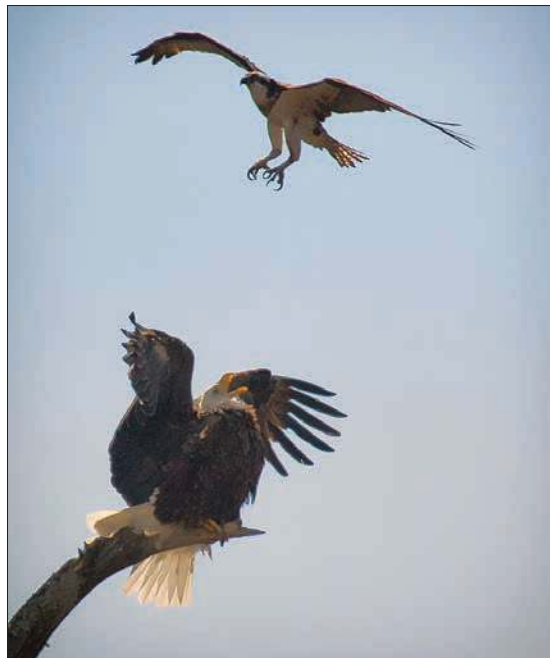
Eagle watching was a popular part of the Earth Day event at ForEvergreen Nature Preserve.