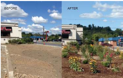
BWA rain gardens have sprouted up at Retro Fitness (above) and Glen Brook Golf Course in Stroud Township.