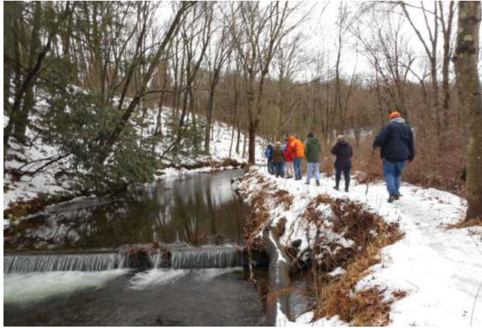
In 2016, the Get Outdoors Poconos hiking series, funded by the William Penn Foundation, helped more than 300 people discover preserved lands in the Brodhead watershed.