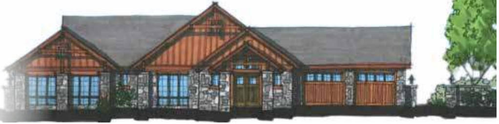
Architect's rendering of Brodhead Creek Heritage Center