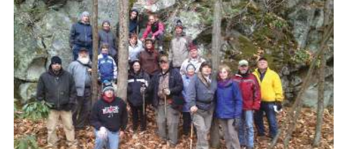
Educating the public at events and walks