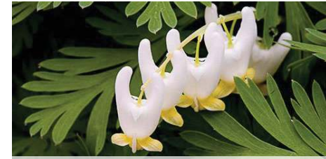
Encouraging native plants to flourish