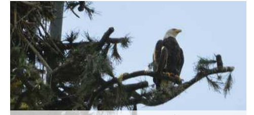
Serving as watershed defenders