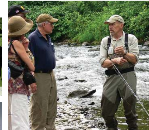
Sharing knowledge and love of the outdoors