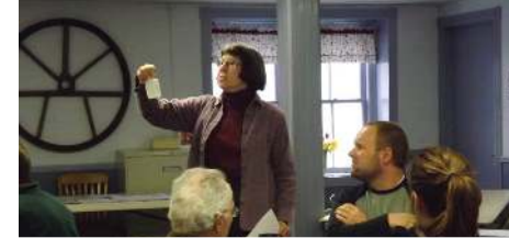
Training and volunteering as Streamwatchers