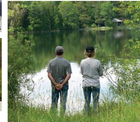
Monitoring the streams where we live