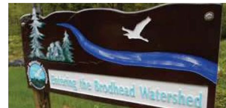
Making our work visible to the public