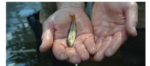
Putting conservation in your hands

The Brodhead Watershed Association is a non-profit organization formed in 1989 to promote and preserve the environment of the Brodhead watershed and the water quality of the Brodhead, Cherry, Marshalls, McMichael, Paradise and Pocono creeks and their tributaries.