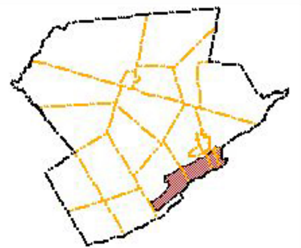
Study Area Location in Monroe County