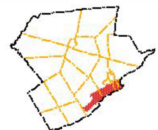
Location in Monroe County