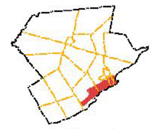
Location in Monroe County