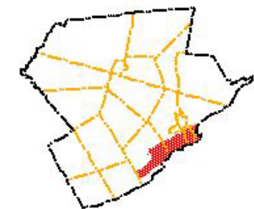
Location in Monroe County