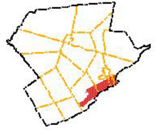
Location in Monroe County