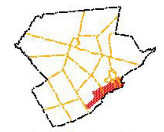
Location in Monroe County